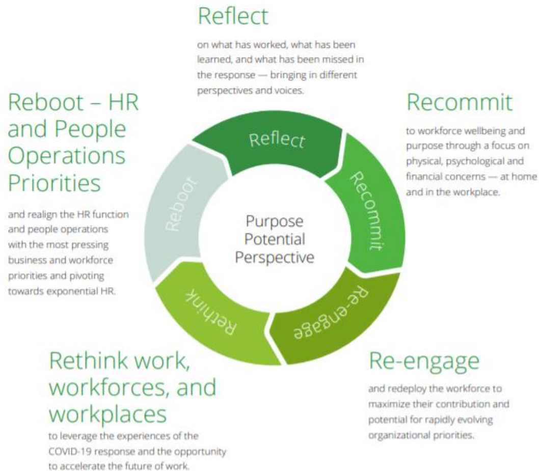
Figure 1. Deloitte